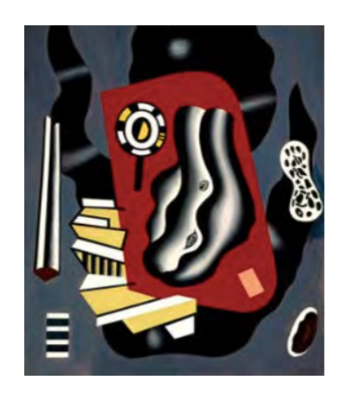
Fernand Léger, Composition in Red and Blue, 1930