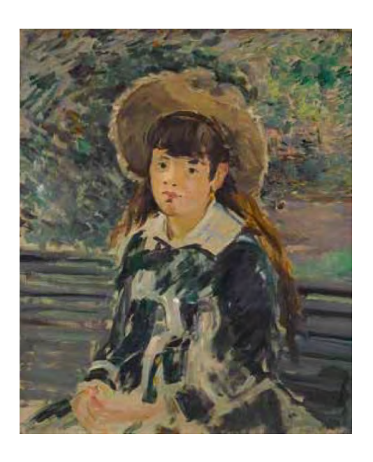
Édouard Manet, Young Girl on a Bench, 1880