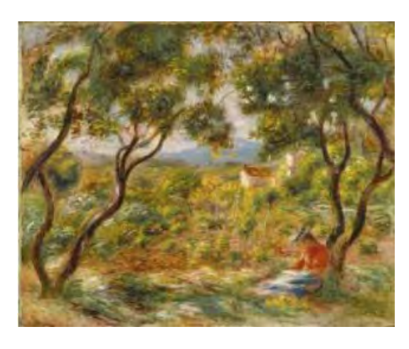
Pierre-Auguste Renoir, The Vineyards at Cagnes, 1908