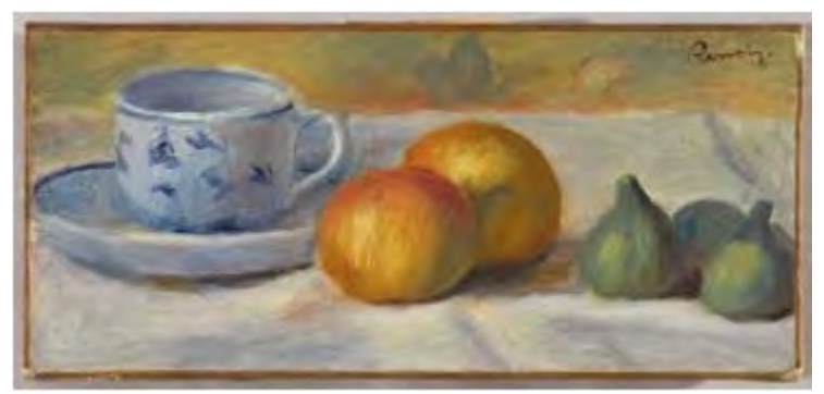
Pierre-Auguste Renoir, Still Life with Blue Cup, circa 1900