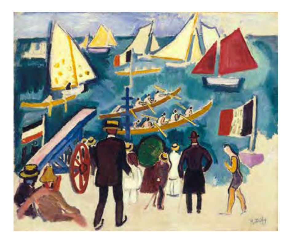
Raoul Dufy, The Regatta , circa 1908–10