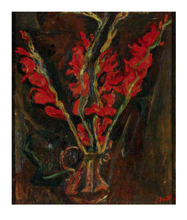
Chaïm Soutine, Still Life Gladiolas, 1919