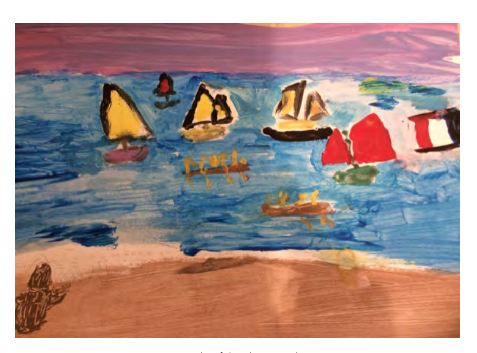
Example of Student Work