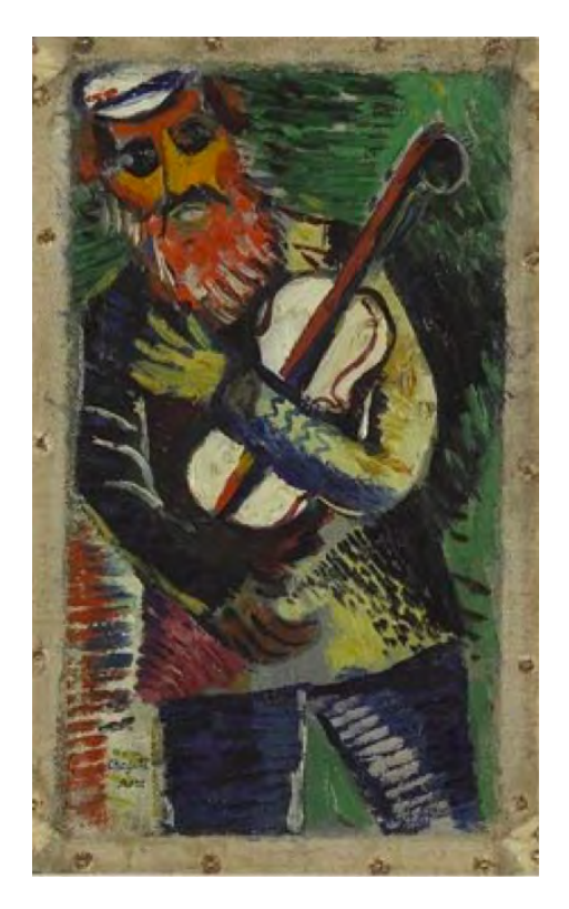
Marc Chagall, The Musician , 1912-14