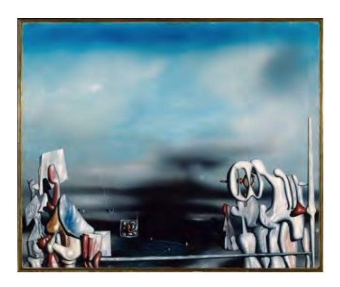
Yves Tanguy, Dress of the Morning , 1946