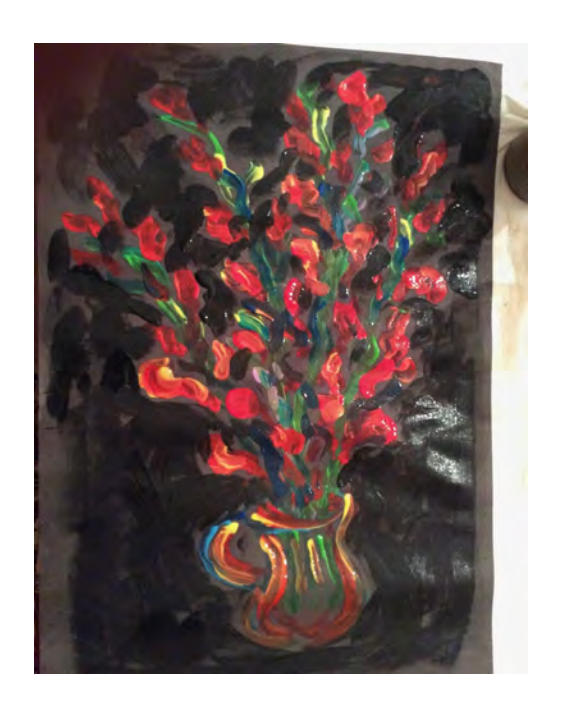
Example of Student work