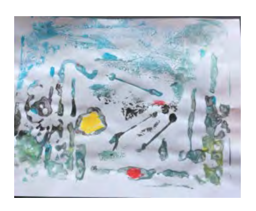
Examples of Student Work