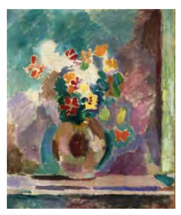
Henri Matisse, Flowers , 1906