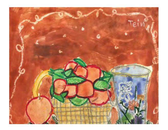
Examples of Student Work