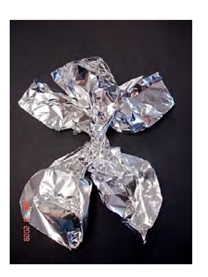
Measure Cut Slits Form waist, then shape