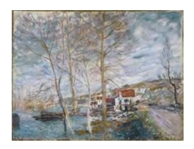
Alfred Sisley, Flood at Moret, 1879